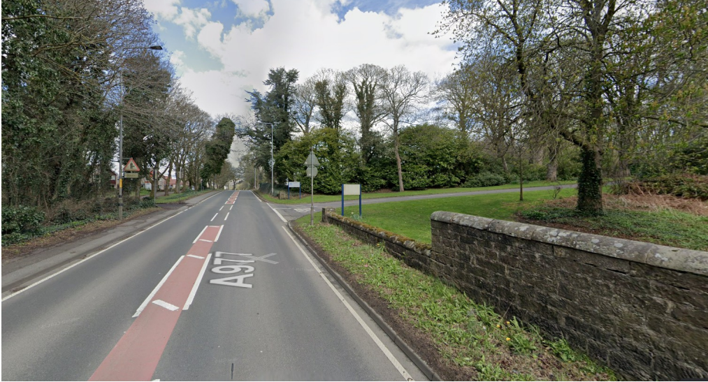
Police College entrance to the right, looking north, approaching from Kincardine.