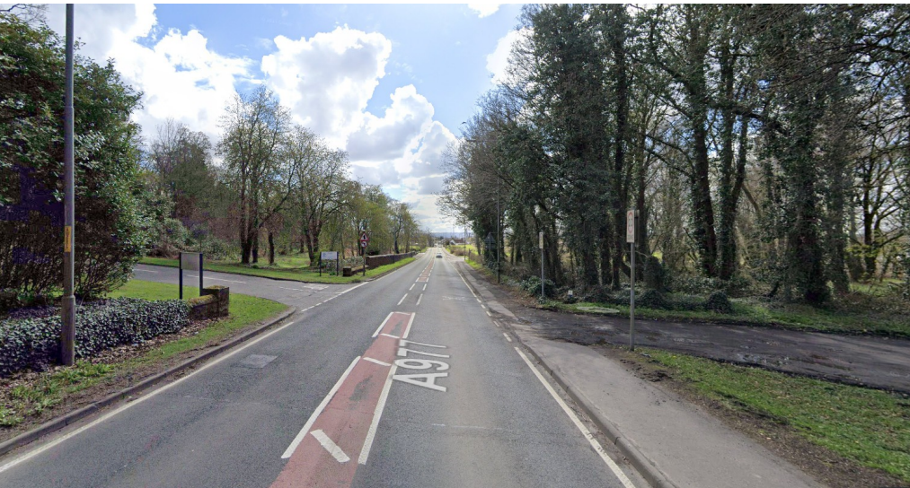
Police College entrance to the left, looking south, approaching from Clackmannan.