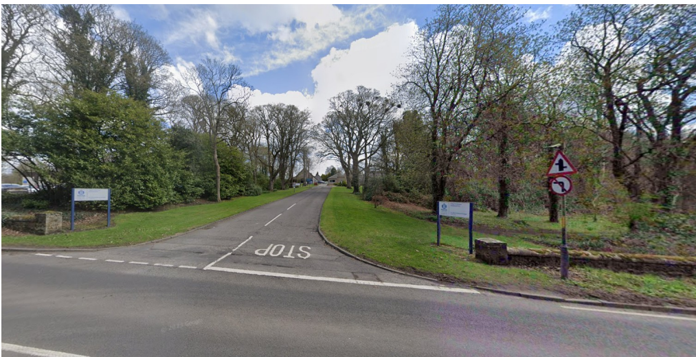
Police College entrance.