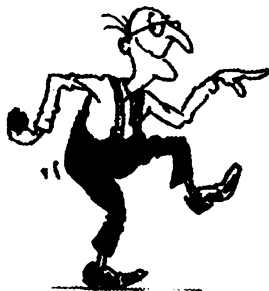
Walk like an ancient Egyptian

Remember Top Hat & Tails & thats just for the women.