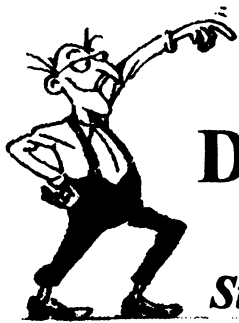
Saturday night teapot

Stirling Management Centre Saturday 23rd November 1996 7.00 p.m 'til late!