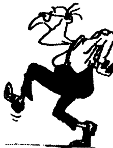
The funky dinosaur