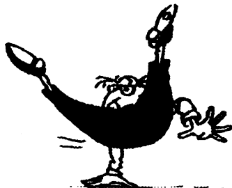
The well-earned break dance