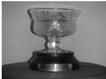
Stirling Sports Council Best Junior Team Trophy

After the awards there was a buffet but while all the food was getting put out all the winners went for a photo which was put in the Stirling Observer.