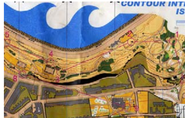
The North Bay map showing the waves in the sea!