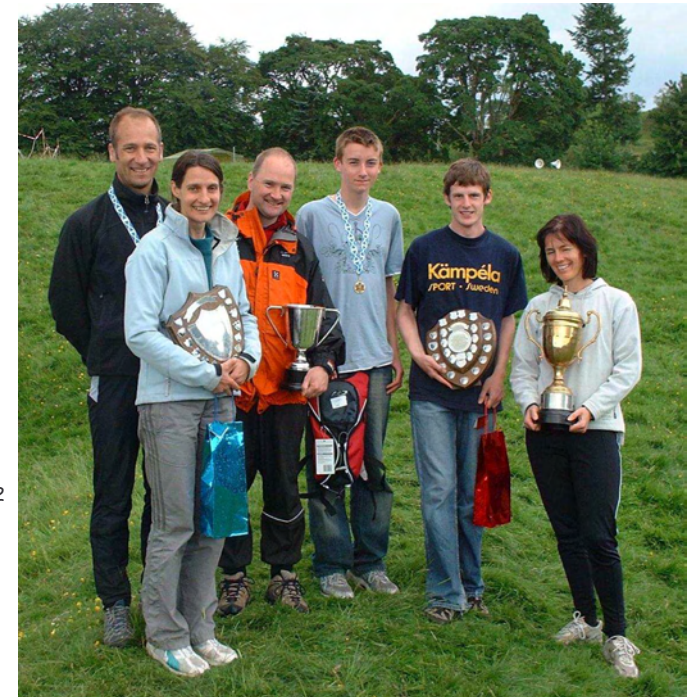
FVO Winners at the Scottish Championships, 2007

Copy date for next issue is Sunday 14th Oct 2007.